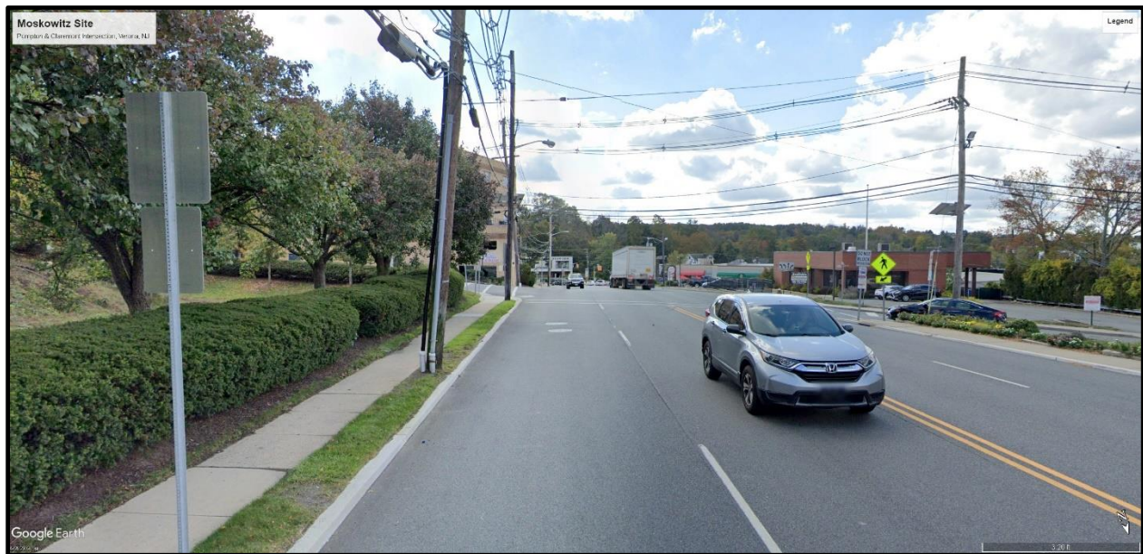
Ground Level From Easterly Side of Pompton Ave Looking Across Intersection to Subject Property