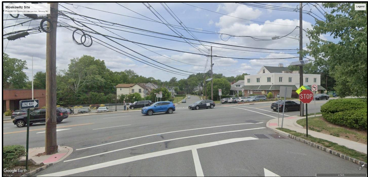
Ground Level at Claremont & Pompton Looking West (Subject Property on far left corner.)