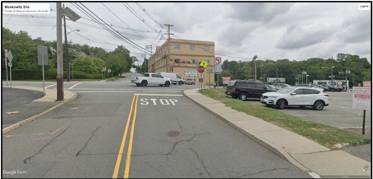
Ground Level at Pompton and Claremont Looking East (Subject Property to the immediate right side)