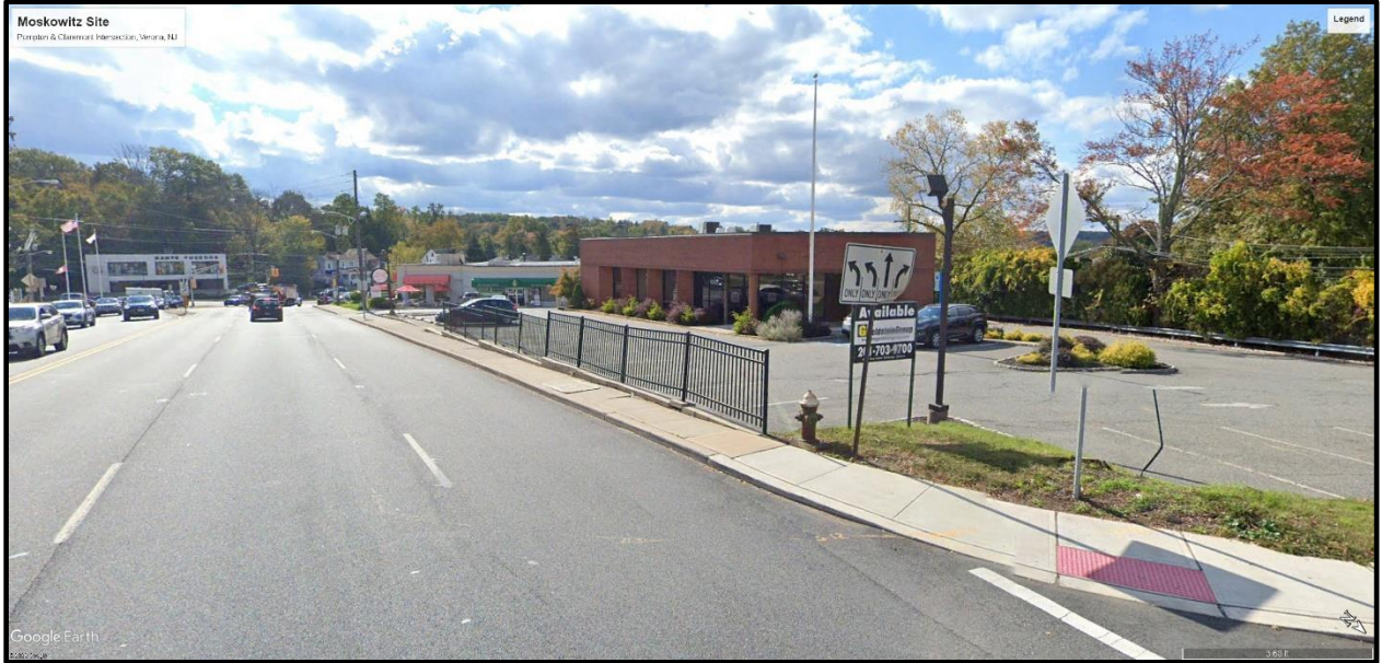
Subject Property at Ground Level Looking Southwest From Pompton Avenue & Claremont Avenue Intersection